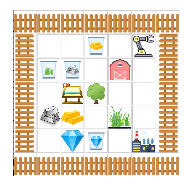
Fig. 3. A 7 \times 7 Craft domain example showing all the various elements available in the domain. The robot is in the top right corner and is controlled by the RL agent presented here. Four trash cans contain different resources: gold, grass, silver, and gems. A work bench, a tree, a tool shed, and a factory provide additional destinations. The general intent is to model a Minecraft-like environment in which resources are processed through several stages.

This may appear to be a rather laborious process, but without ensuring both hardness and diversity, we found that the generated formulas are uninteresting and fairly